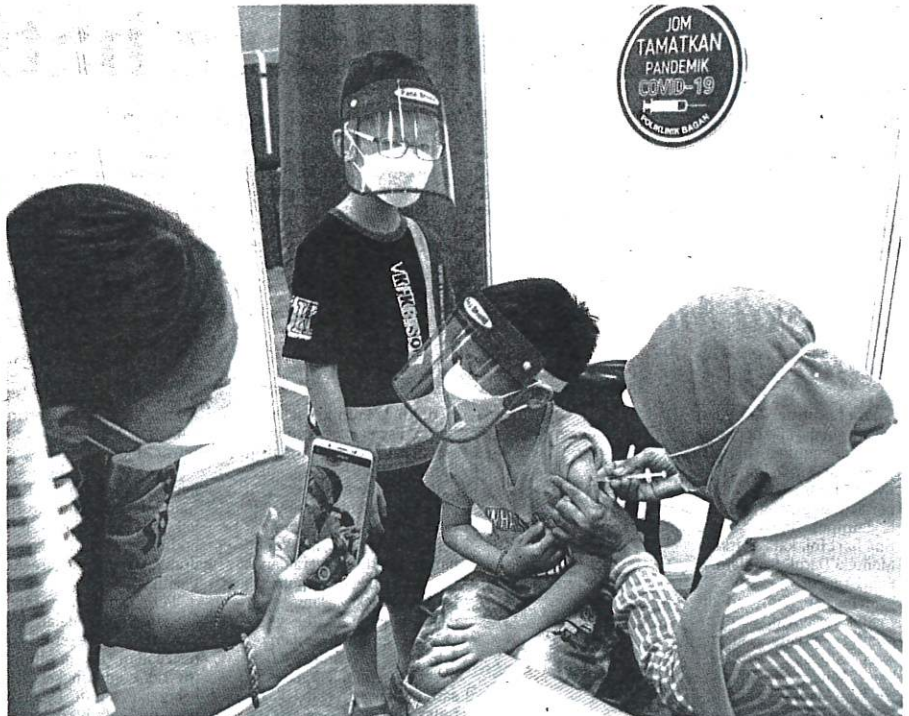
PETUGAS perubatan memberikan suntikan vaksin Covid-19 dos pertama kepada kanak-kanak di Pusat Pemberian Vaksin (PPV) Offsite Tapak Ekspo Seberang Jaya, semalam.

"Bagaimanapun, kedua-dua fasiliti terbabit dilaporkan masih beroperasi seperti biasa," katanya.