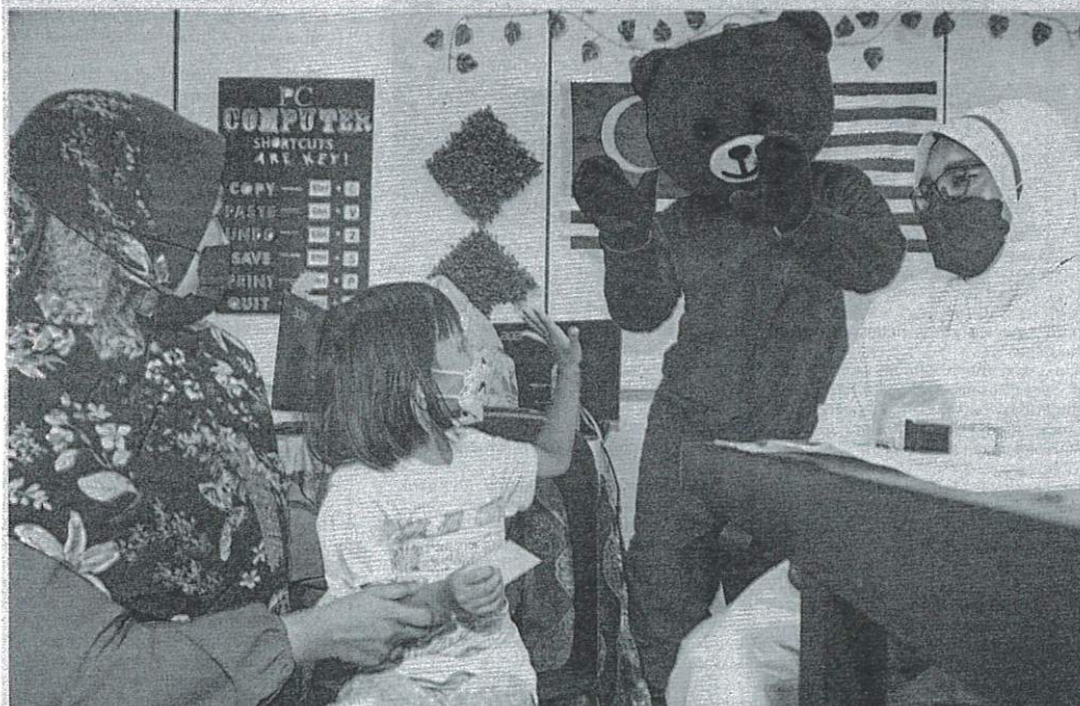
A mascot greeting a child at a PICKids vaccination centre yesterday in Parit, Perak.

"The government is also confident that the consent of the Sultan to make the taking of the booster dose mandatory to perform Friday prayers at mosques is based on the Fiqhiyyah concept, namely sadd adz-dzara' , which means to prevent something that can bring damage and danger," he said. - Bernama