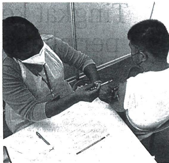
Petugas perubatan memberikan suntikan dos penggalak di Pusat Pemberian Vaksin (PPV) Offsite Dewan Ang Si Chong, di Butterworth, semalam.

kan 94 peratus penggunaan katil itu, diikuti Johor (69 peratus), Putrajaya (67 peratus), Kuala Lumpur (62 peratus), Perak (58 peratus) dan Melaka (58 peratus).