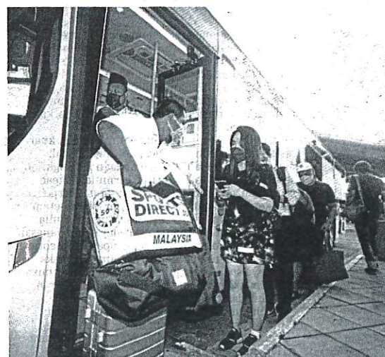
VTL darat membabitkan Stesen Bas Queen Street, Singapura, ke Terminal Larkin Sentral, mula dilaksana pada 29 November lalu, dengan kuota 1,440 individu pada minggu pertama. (Foto hiasan)

"Penggunaan keseluruhan alat bantuan pernafasan adalah sebanyak 35 peratus meliputi untuk pesakit COVID-19 dan bukan COVID-19," katanya.