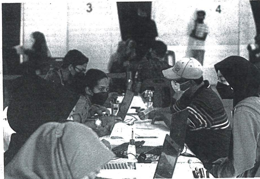
ORANG ramai menunggu giliran untuk mendapatkan suntikan vaksin Covid-19 dos penggalak di Pusat Pemberian Vaksin (PPV) Offsite Dewan Ang Si Chong, Butterworth, semalam.