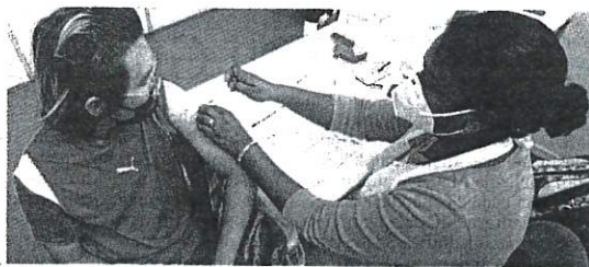
Petugas perubatan memberikan suntikan dos penggalak kepada penerima di PPV Offsite Dewan Ang Si Chong, semalam.

Berdasarkan data dalam COVIDNOW, Kelantan secara keseluruhan merekodkan pemberian sebanyak 2,298,896 dos vaksin COVID-19.