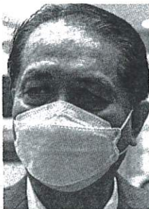
DR Noor Hisham

Dr Noor Hisham berkata, terdapat tujuh kes kejangkitan saluran pernafasan akut (ARI) dan satu kes penyakit kulit dilaporkan se-