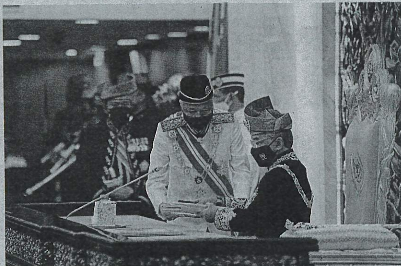
Royal speech: Prime Minister Datuk Seri Ismail Sabri Yaakob presenting the royal address to the King at the First Meeting of the Fifth Session of the 14th Parliament in Kuala Lumpur.

After having contracted 5.6% in 2020 due to the Covid-19 pandemic, the King said Malaysia's economic growth of 3.1% in 2021 showed the